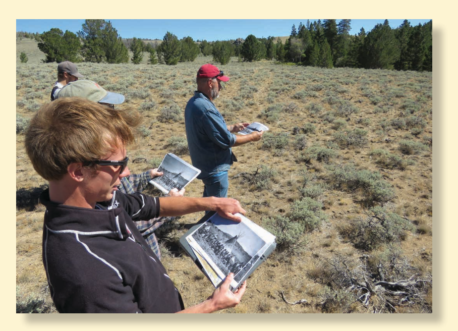
CWC archaeology students comparing historic images to the modern landscape for a georeferencing project to determine the location and the site boundaries of Washakie's September 1870 camp on Willow Creek.

Traditional archaeological field methods involve walking the ground, but this site is closed to the public. Central Wyoming College archaeology students rephotographed the site from public land to compare with Jackson's historic photos. Using these images in conjunction with geospatial information systems data and georeferencing software they were able to calculate where Jackson put his camera, determine the location of Washakie's painted war tent, clusters of family or clan lodges, and map the site boundaries