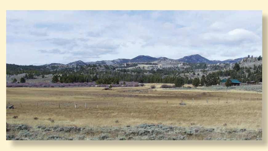
Recent September view to the northwest over the valley where Washakie and the Eastern Shoshones camped in September 1870. The two highest mountains on the horizon are Renneker and Pabst Peak. Notice that after a century of fire suppression on the national forest there is much more timber now than during early historic times.

without setting foot on privately owned portions of the site. The area in the site overview photograph is about 12 acres. The other 1870 photos indicate the camp extended quite a distance to the north and was over 30 acres in total size.