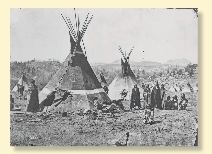
"The War Chief's Tent", Washakie's headquarters, was the only decorated tepee in the entire village. The lodge is decorated with broad bands of black, yellow and white and a large star burst or medicine wheel, another circle, and an animal, possibly a deer. The tepees are staked down with wooden pegs, and surrounded by pieces of firewood, horse manure, iron pots and pans for cooking. Men, women, children, and one blurry dog are shown sitting and standing around this tepee dressed in traditional and manufactured clothing. The Shoshone camp was full of trade goods because the Shoshones had been bartering hides, beaded and quilled moccasins and other items with mountain men, trading posts, and Oregon Trail emigrants for almost forty years when this photo was taken by Jackson.

elderly person could find it through the smoke, dust and fear of crisis and know they would be taken care of, while other adults would receive instructions about how to respond to any threat.